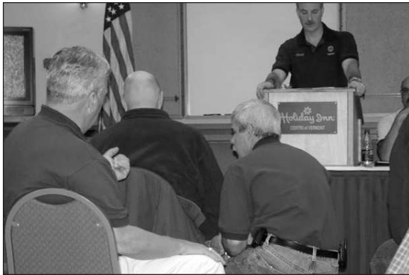
Members at the business meeting.