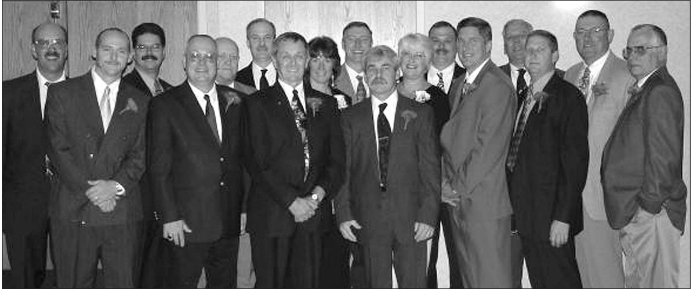
2004 Board of Trustees of the Vermont Police Association.